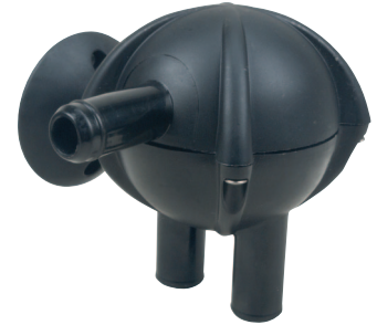
Fig. 0723 Left Facing Mount Shown for 5/8" Hose

NOTE: Series 0723 AF Separators cannot be mounted in engine compartments. If that is the only location option, then use 0488H Series AF Separators, which are factory equipped with heat shields approved for engine compartment placement.